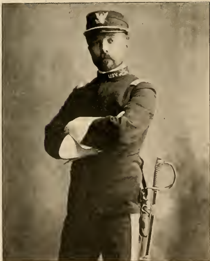
BRIGADIER- GENERAL FREDERICK FUNSTON.